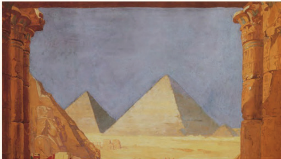
Louis Comfort Tiffany, Egyptian Pyramids Framed By Temple Columns , 1872

Standing upon the summit the disciple breathes in — the air clear, rarefied. The journey has been long and arduous. The Path, steep. Many mountains have been scaled, many victories attained. Much has been learned, and yet more still must be won. He knows his work is not yet complete. Standing alone, there upon the threshold of the Ascension Temple, he knocks.