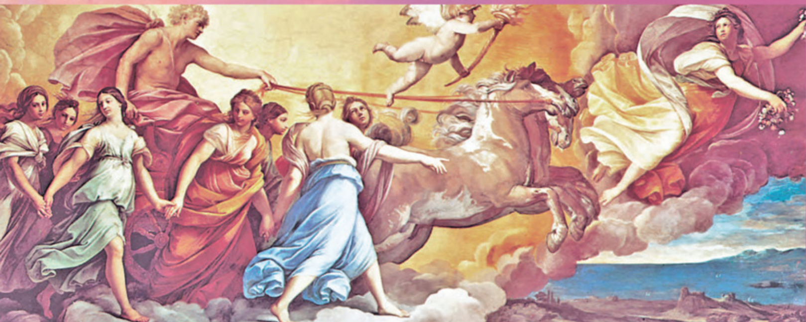
Guido Reni, Aurora , 1614

The understanding of the Fountain of Youth that is the Heart of your own Beloved Mighty I AM Presence is a glorious inheritance bequeathed to the Torch Bearers of The Temple, given at the bequest of the Ascended and Cosmic Beings, especially by the largess of Heart of our own Beloved Saint Germain.